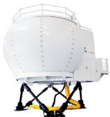
CAE3000MR SERIES Full-Flight and Mission Simulators

CAE's Mission Reality training devices provide the training experience required to help ensure mission readiness.