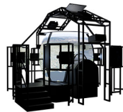
CAE Full-Mission Simulators with CAEMedallion MR SERIES VISUAL SYSTEM