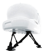
CAE7000MR SERIES Full-Flight and Mission Simulators